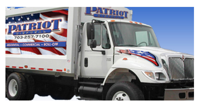
Tuesday - Household Trash

Visit: <a href="http://www.comptonvillage.org/pages/park-ing.html">http://www.comptonvillage.org/pages/park-ing.html</a>