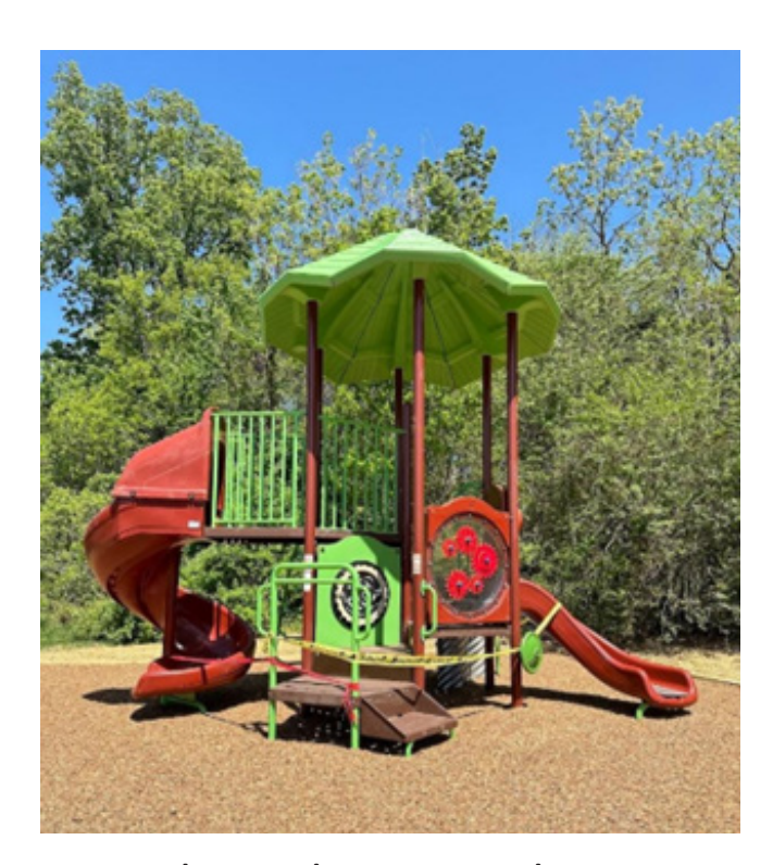
Darkwood Court and Drive St. Timothy's Lane

Please note that these play areas are not complete. Benches, trash cans, and fencing will be added in the near future.