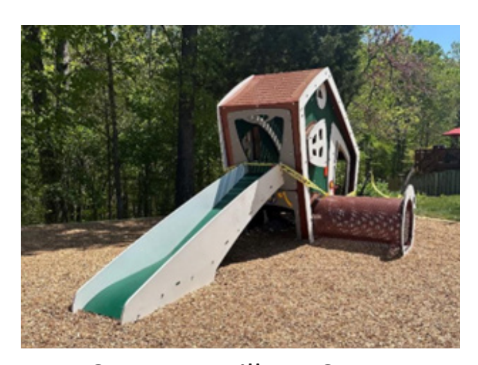
Compton Village Court

Please note that these play areas are not complete. Benches, trash cans, and fencing will be added in the near future.