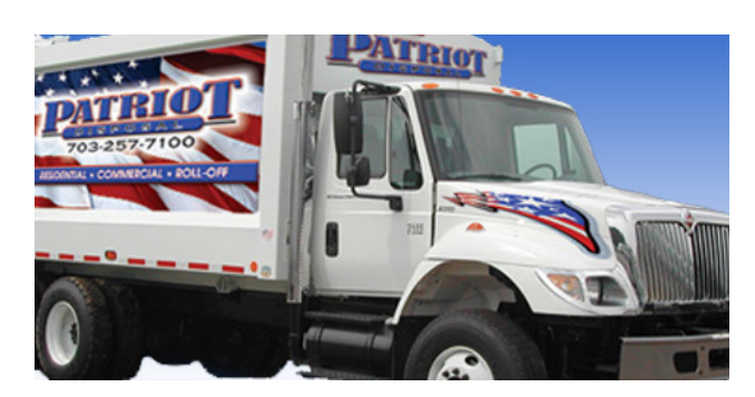
Tuesday – Household Trash

Visit: <a href="http://www.comptonvillage.org/pages/park-ing.html">http://www.comptonvillage.org/pages/park-ing.html</a>