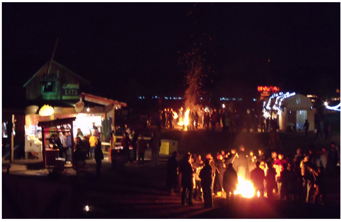
The Compton Village Voice July / August 2023 Page 3 of 11

Explore Cox Farms after dark at <u>Fields of Fear</u>, where you can creep through more than 20 acres of fear and spooky attractions like the Cornightmare house, the Forest, or the Dark Side Hayride.